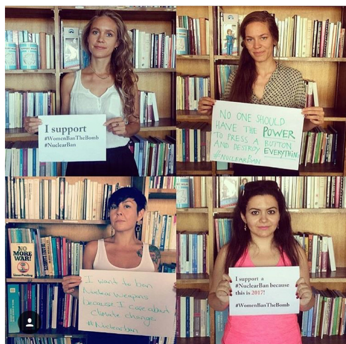
The WILPF International team in Geneva show their support for the ban!

Through our role as a steering group member of the International Campaign to Abolish Nuclear Weapons (ICAN), we have mobilised across the globe through advocacy, developing policy briefs and conducting research, monitoring discussions and negotiations, and speaking out on media and social media.