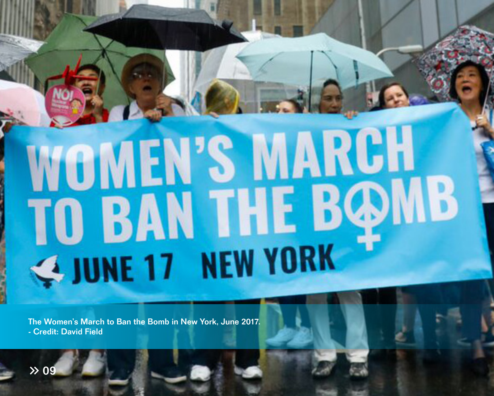
The Women's March to Ban the Bomb in New York, June 2017.