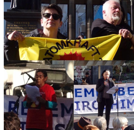
WILPF members take part in activities across Australia in support of the ban treaty.