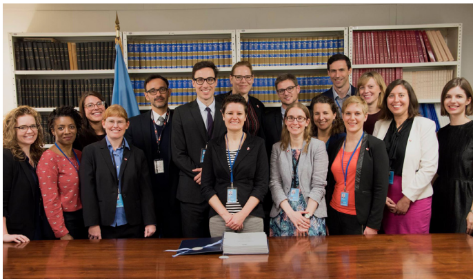
Members of the International Campaign to Abolish Nuclear Weapons (ICAN) view the official copy of the Treaty on the Prohibition of Nuclear Weapons.

WILPF can continue to play an active role in this important and exciting new phase, particularly at the national level where interacting with legislators and government officials in capital will be necessary, including to foster knowledge and relationships that will aid in the Treaty's effective implementation.