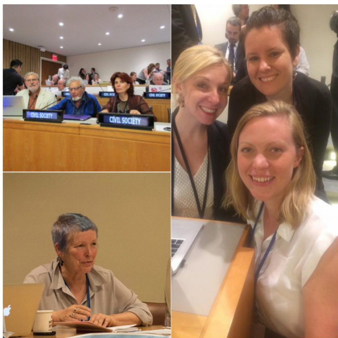
WILPF members and staff participate in the negotiations of the Treaty on the Prohibition of Nuclear Weapons at the United Nations in New York.