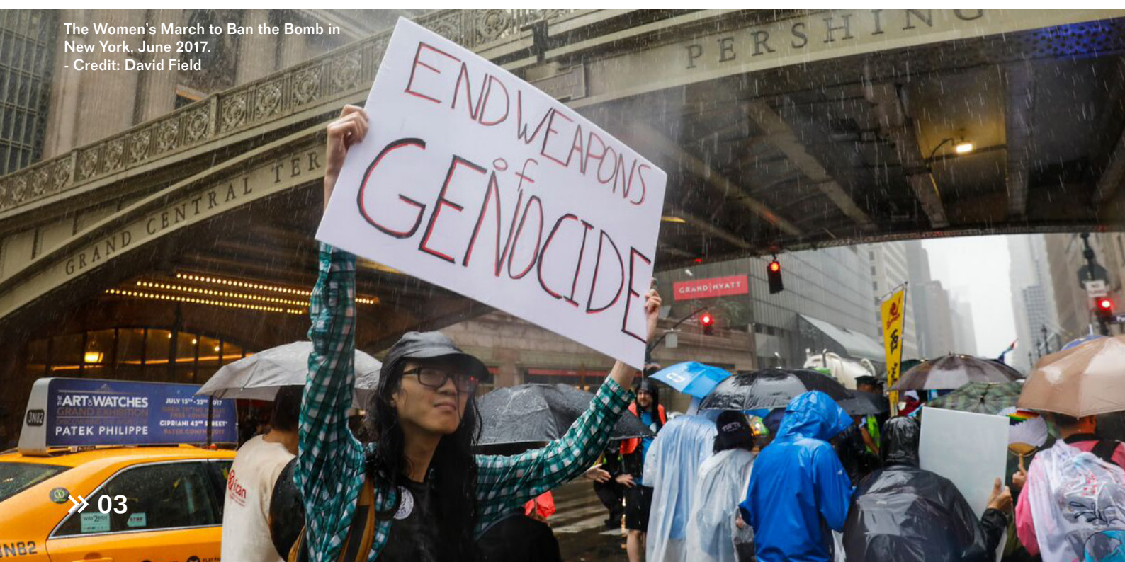
The Women's March to Ban the Bomb in New York, June 2017.

This resource guide is meant to help us carry on with that work, through working with governments and others in civil society to ensure the Treaty's rapid entry-into-force and effective implementation. We provide an overview of what the Treaty includes, examples of past work, suggestions for future action, and where to find further information.