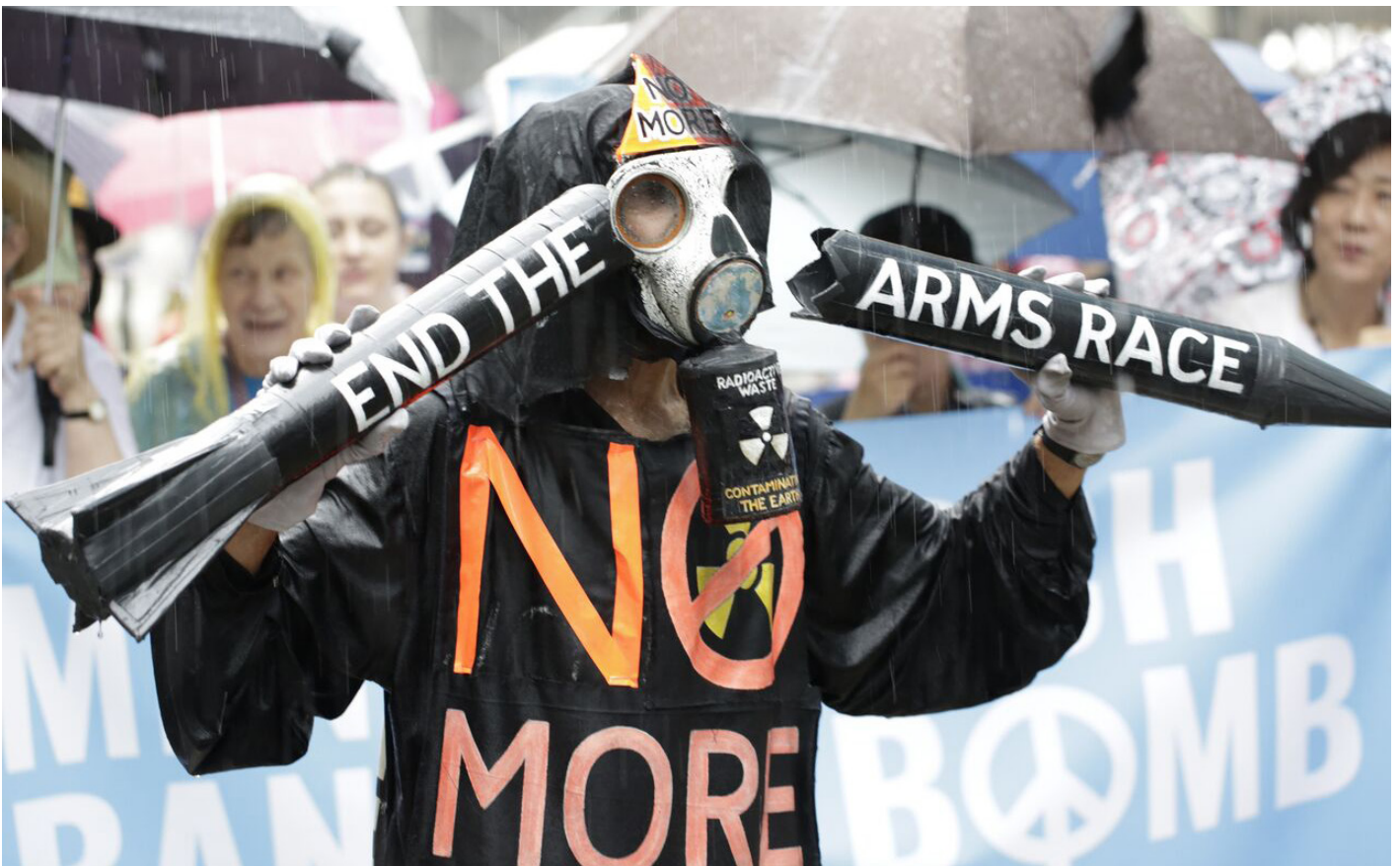
The Women's March to Ban the Bomb in New York, June 2017.

In the case of the ban treaty, this approach links caring about humanitarian concerns to being weak, and asserts that “real men” have to “protect” their countries. It implies that the pursuit of disarmament is an unrealistic, irrational, and even effeminate objective. Scholars of gender and disarmament have for decades been highlighting and challenging this discourse (some of which we have listed at the end of this guide); with the TPNW we have an incredible opportunity to confront and disrupt this mainstream narrative and to showcase the effectiveness of collective action for global security.