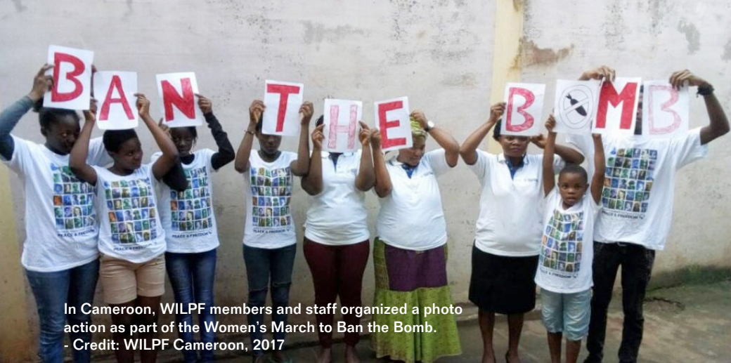
In Cameroon, WILPF members and staff organized a photo action as part of the Women's March to Ban the Bomb.