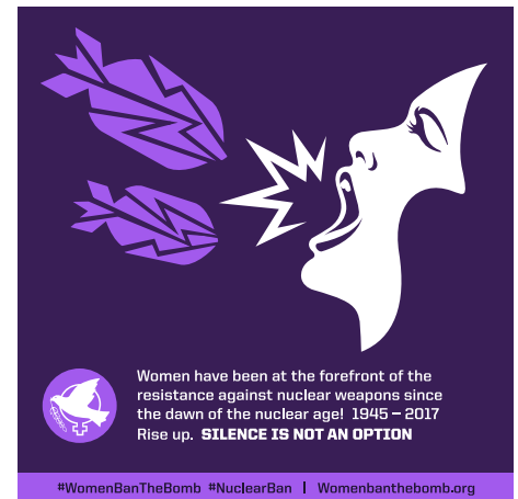
Infographics by Carlos Vigil, 2017.

event. The primary march and rally took place in New York City, complemented by around 150 diverse solidarity actions from WILPF sections and members in Afghanistan, Australia, Bolivia, Canada, Belgium, Denmark, Germany, Ghana, Italy, Japan, Lebanon, New Zealand, Norway, the Philippines, Scotland, Spain, Thailand, the UK and the US—truly a day to be proud of!